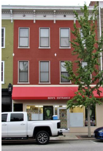
120 East Main Street

The Belleville News-Democrat in recent months has run a series of articles on the pending demolition of buildings. The Belleville Historical Society has provided information to newspaper reporters on the histories of these buildings and their value to the community. As noted in our Mission Statement, part of our commitment is to help preserve the historic architecture of our city.