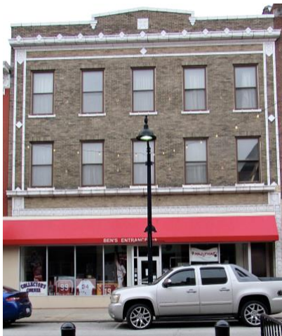
116 East Main Street