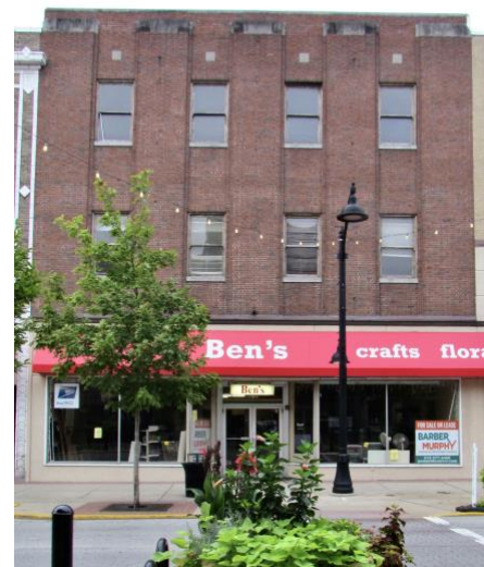
112 East main Street

Of What Use Is an Old Building By Robert D. Brunkow